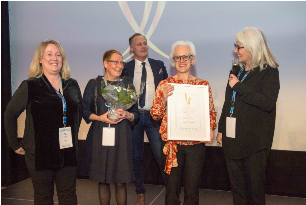
First Card, Photo credit: Christian Valtanen