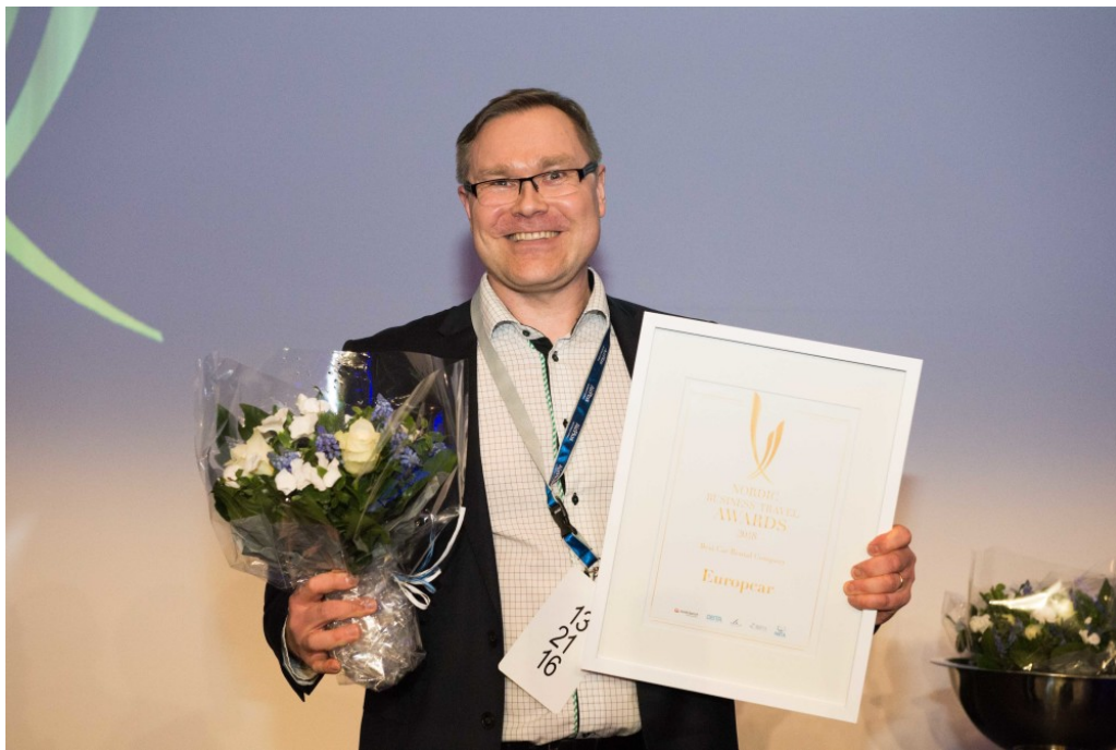
Europcar, Photo credit: Christian Valtanen