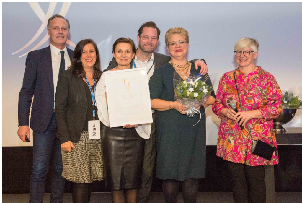
Clarion Hotels

SBTA – Swedish Business Travel Association, är en köparledd branschorganisation. SBTA har i dagsläget över 250 medlemsföretag i både offentlig och privat sektor. Föreningens medlemmar består av både köpare