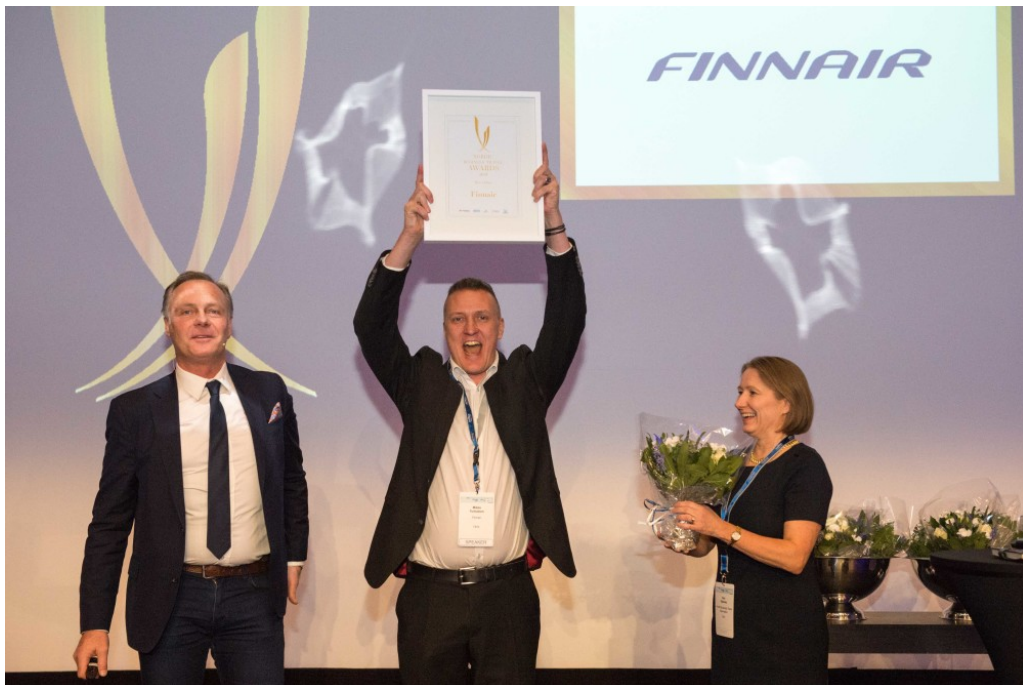
Finnair, Photo credit: Christian Valtanen