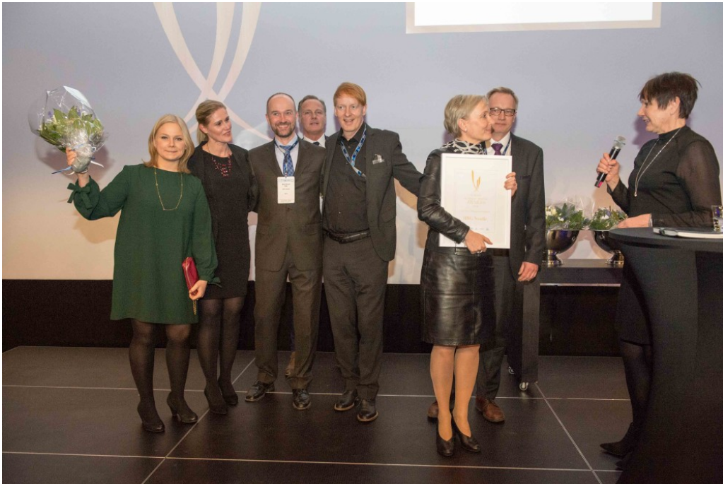
HRG Nordic, Photo credit: Christian Valtanen