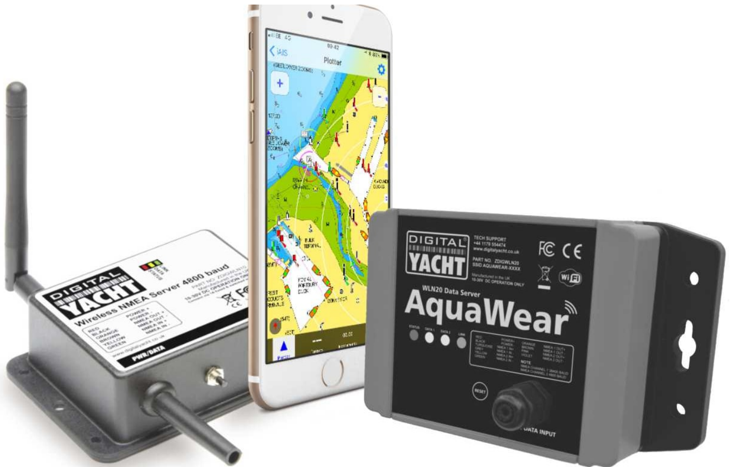
The WLN10 and WLN20 from Digital Yacht turn your iPhone or iPad into a full function, integrated navigation device