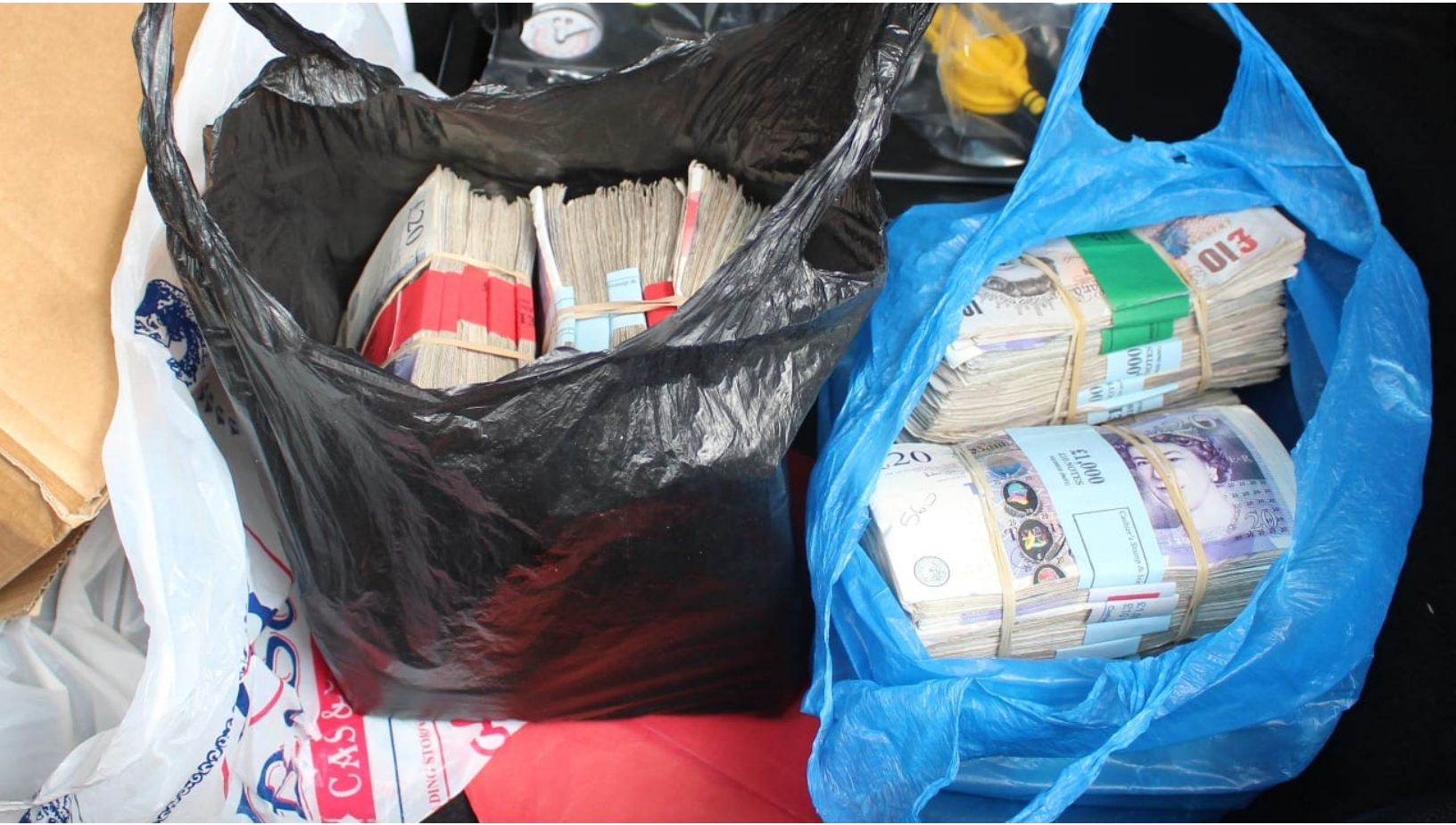
Cash found in Singh's vehicle