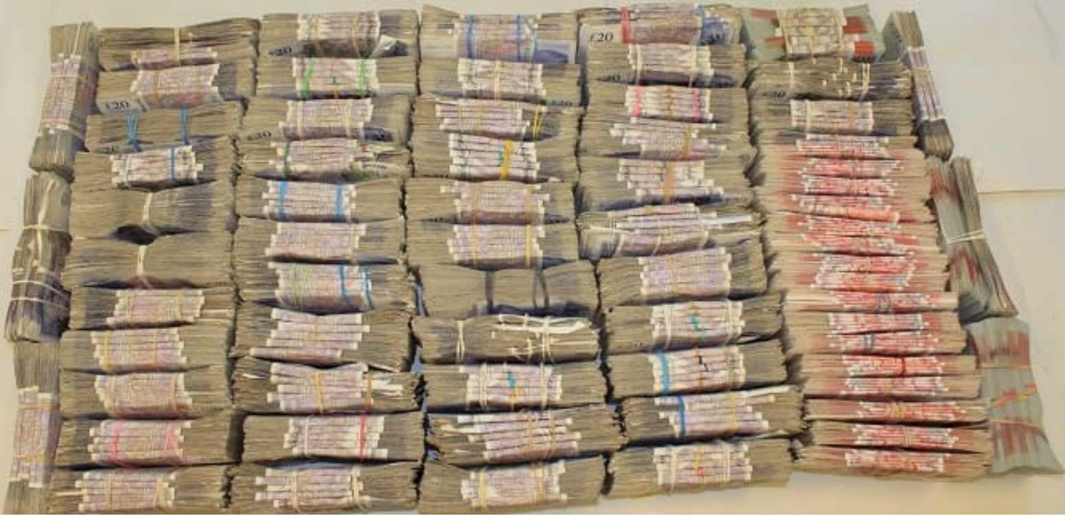
A bundle of cash seized by HMRC